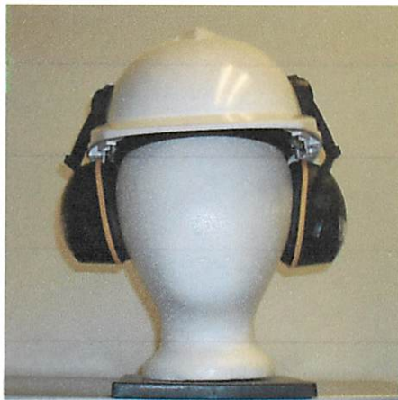
Test Item: Q3184A

These data were obtained through measurements made at the laboratories of Michael & Associates, Inc., State College, PA , USA. Michael & Associates, Inc., is accredited to test to ANSI S3.19-1974, ANSI S12.6-2008, ANSI S12.42-2010, EN352 parts 1-8 and AS/NZ S1270:2002 by the National Institute of Standards and Technology (NIST) National Voluntary Laboratory Accreditation Program (NVLAP).